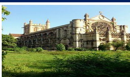
All Saints' Cathedral