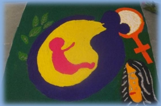
1 st -Rangoli Express