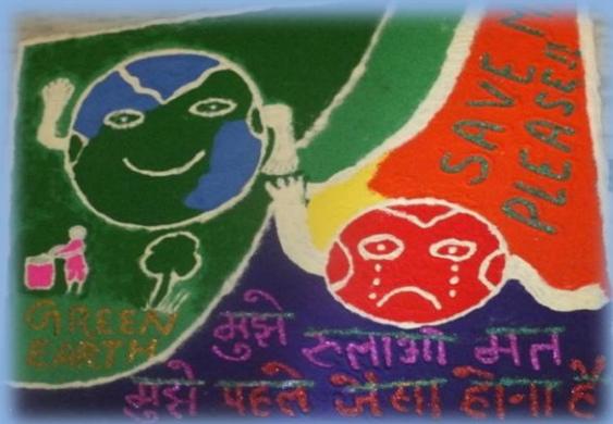
3 rd -Star Group