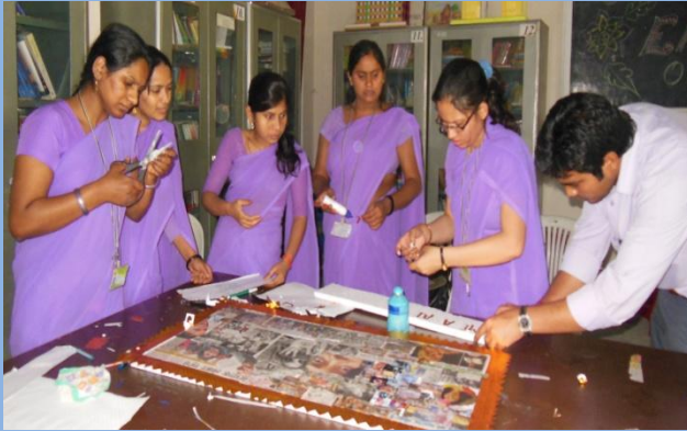
3 rd -Sweet Group