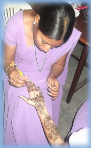
1 ST -Km.Neetu