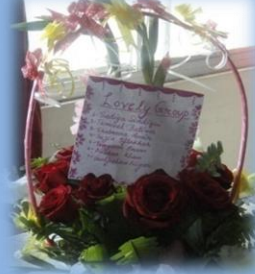
3 rd -Lovely Group