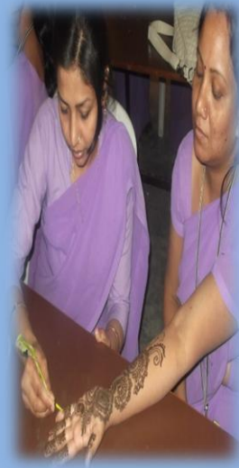
3 rd -Gulfishal Nigar