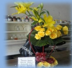
1 st -Flower Express