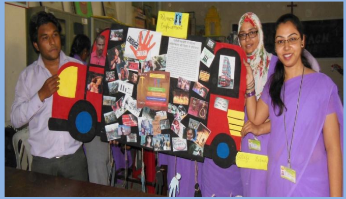
2 nd -Collage Express