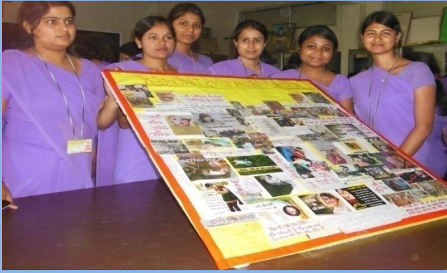
1 st -Women Power