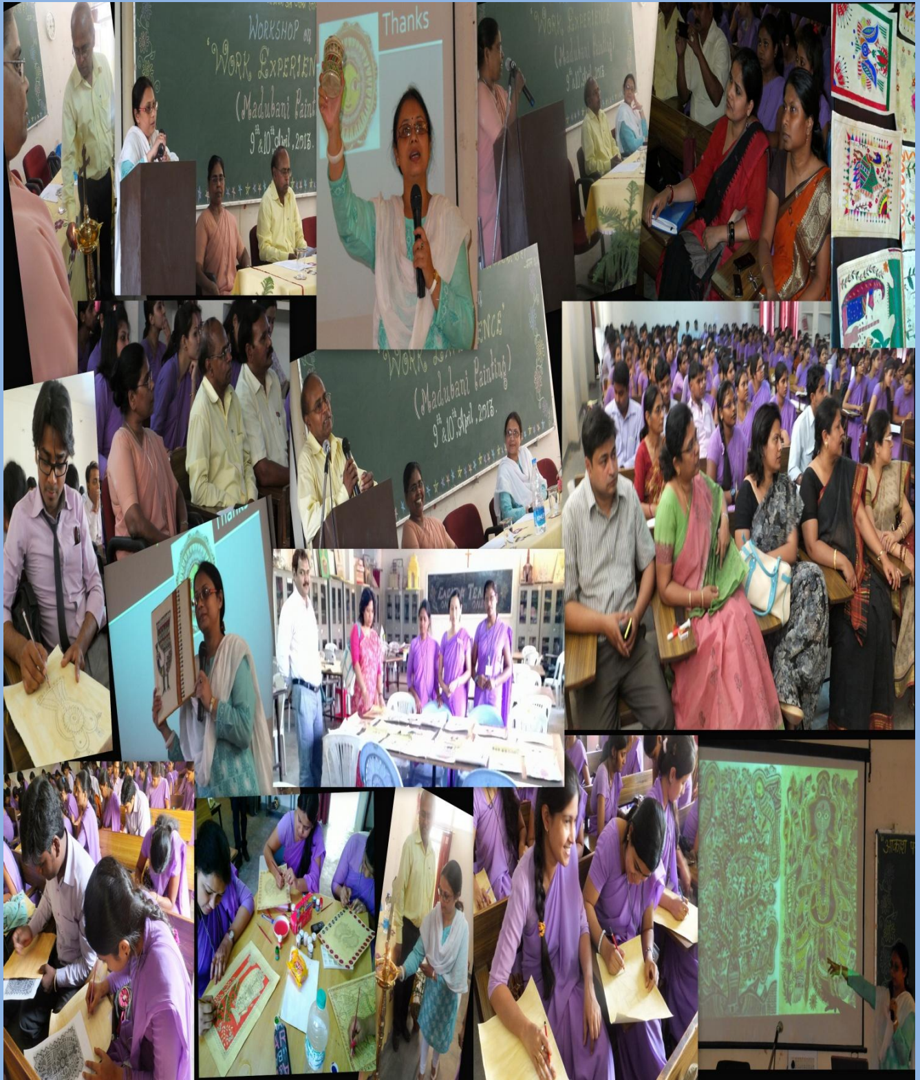
GLIMPSES OF THE WORKSHOP