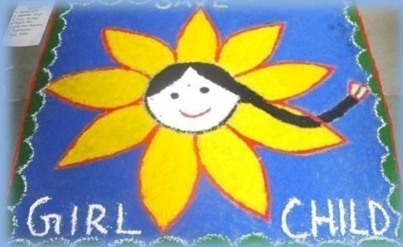
2 nd -Colourful Group