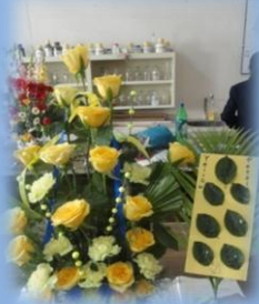
2 nd -Yellow Petals